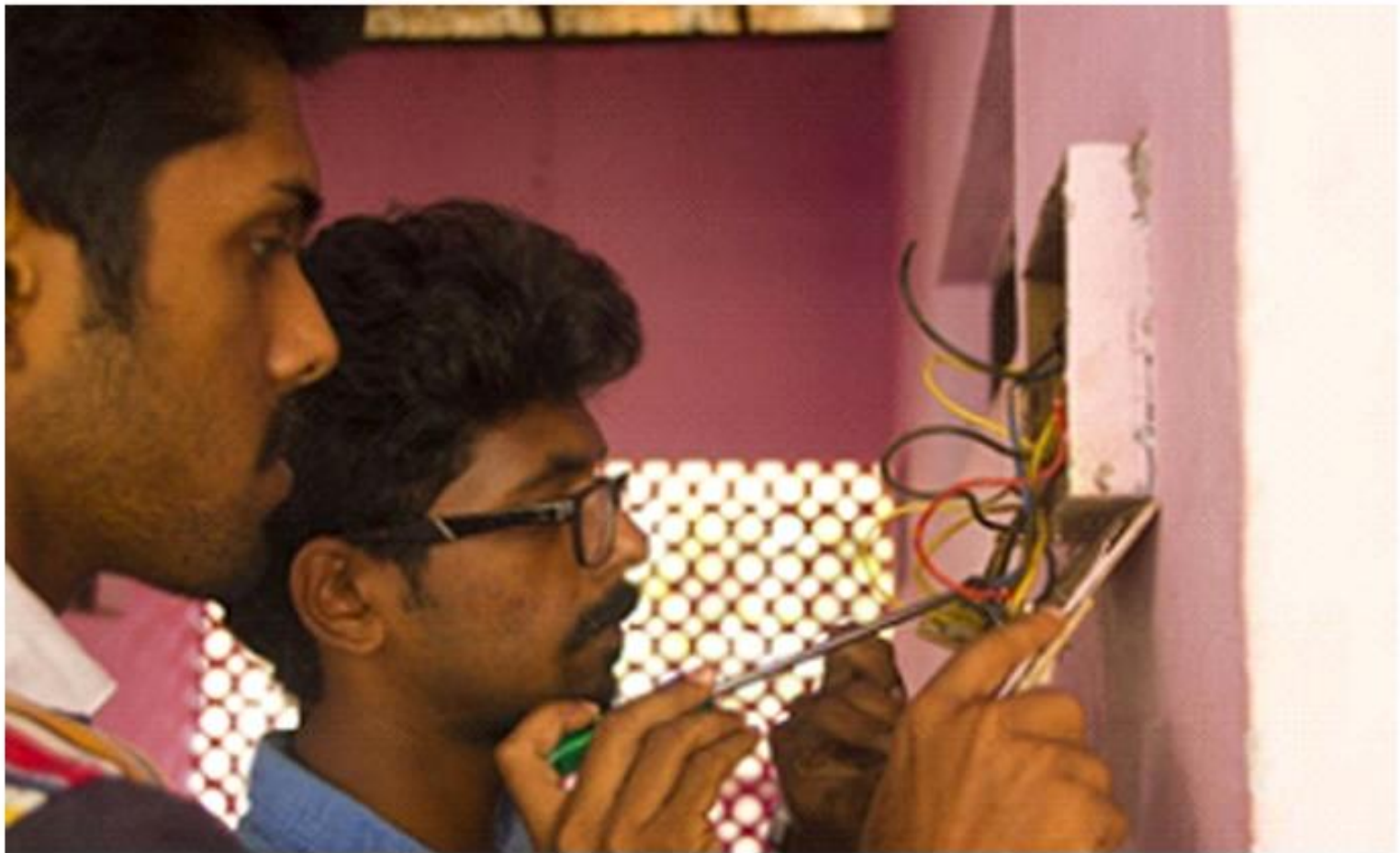
Electrical works at Balabhavan and Bhalikabhavan.