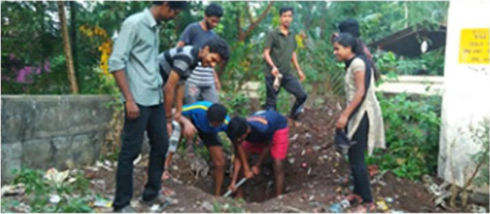
Cleaning School premises and constructing waste pit. Painting School Building.