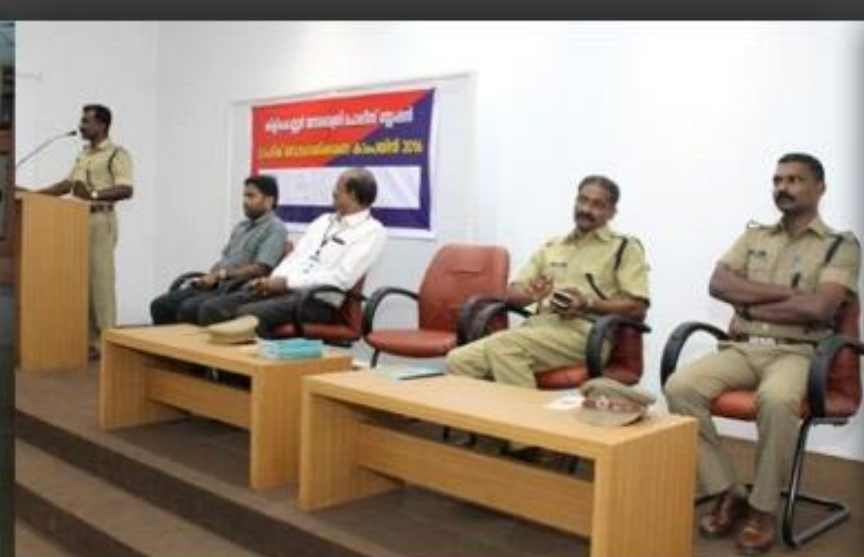
Traffic awareness class