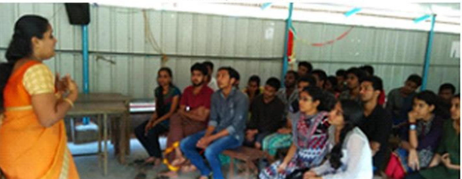
Volunteers received classes in topics including AIDS Awareness.