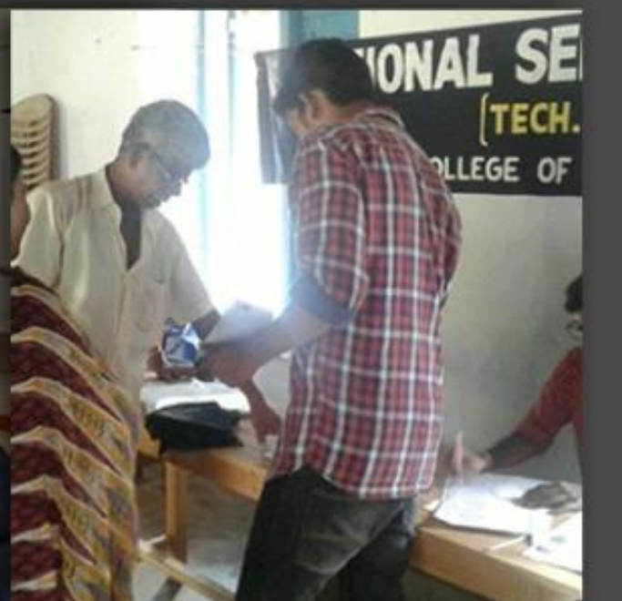
Community interaction and outreach