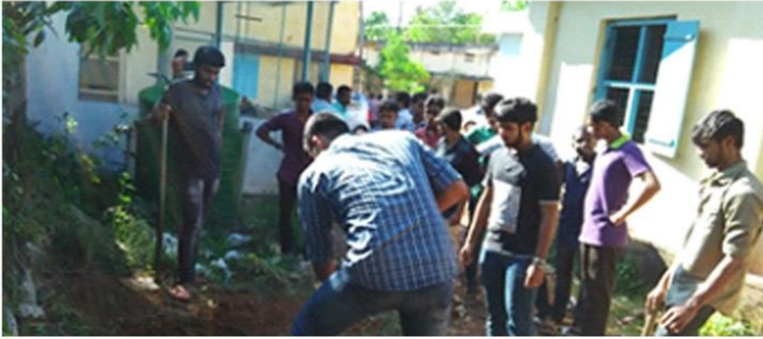
Construction of vegetable garden in the Peroor school premises.