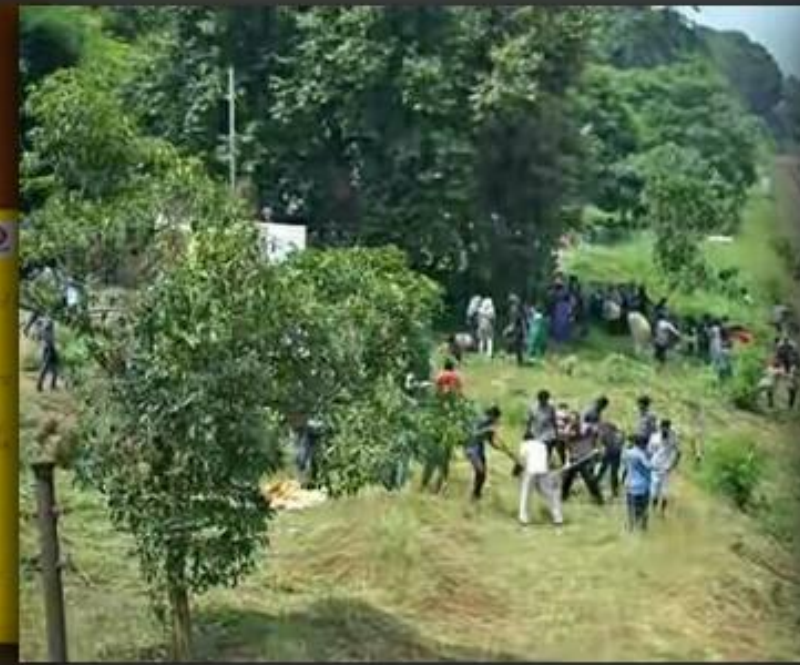
Volunteered campus cleaning Drive by College Union