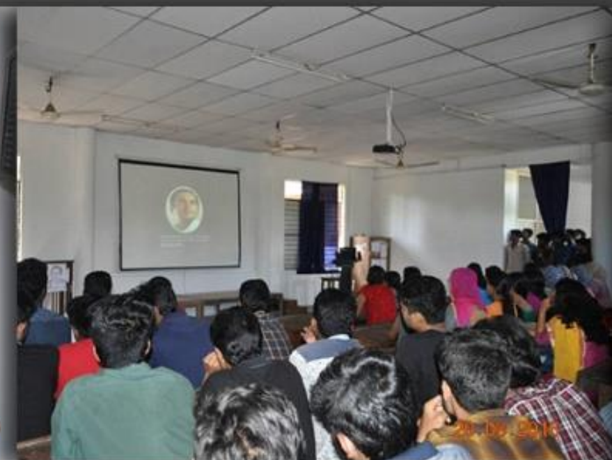
Observed Sadhbhavana Day