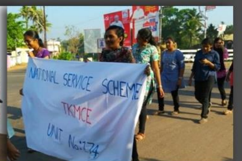
Martyr's Day Peace Rally