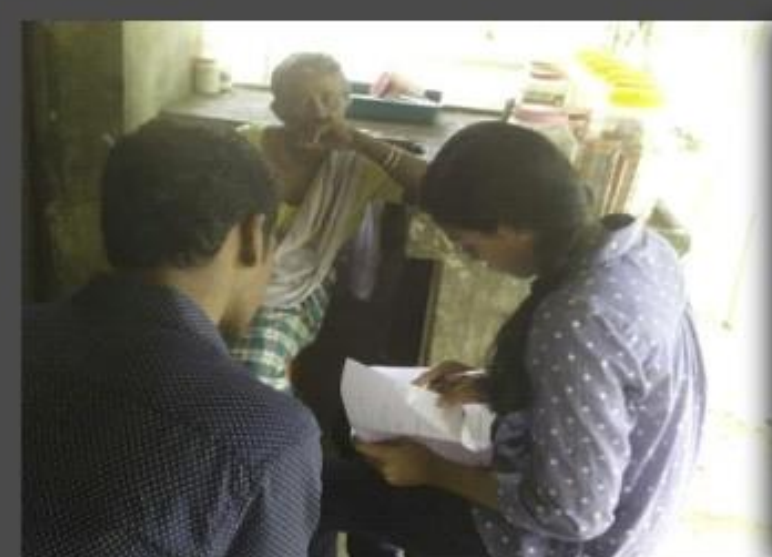
Socio Economic survey at adopted village.