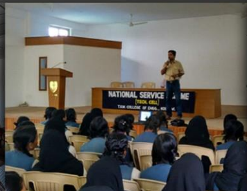
NDLM-National Digital Literacy Mission Campaign - Awareness class