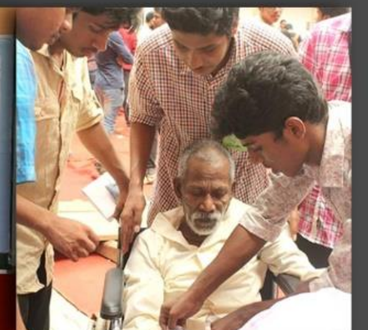
Volunteered Sukrita'16 an initiative by STEPS TKMCE