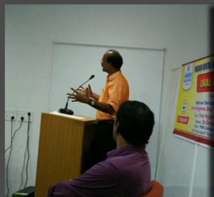
Oral hygiene day awareness class