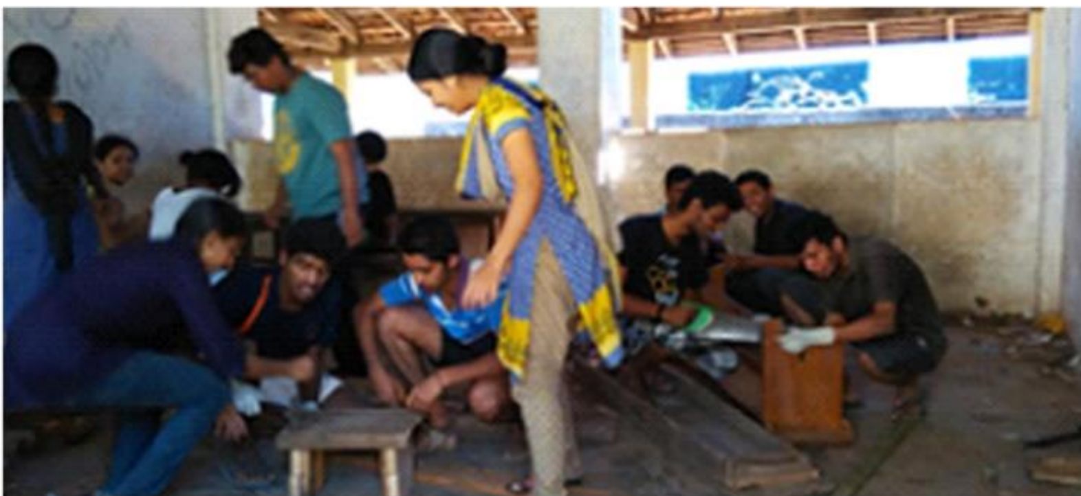
Repairing the furniture in the MVGHSS, Peroor, Kollam.