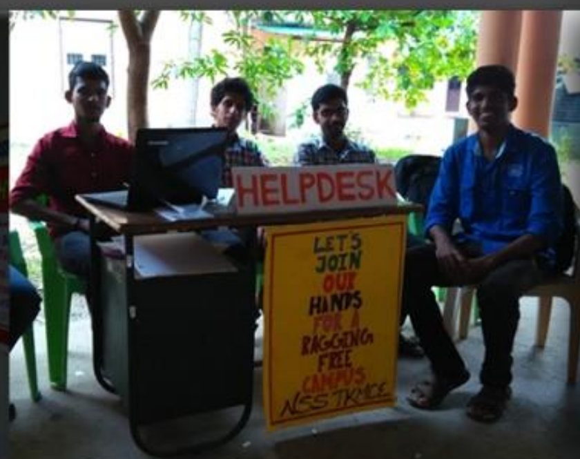
Help desk during first year admission