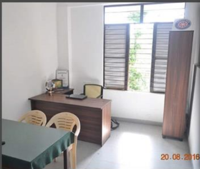
New office of NSS Unit TKMCE